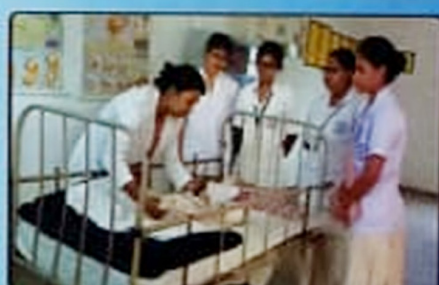
Computer Audio Visual centre Laboratory