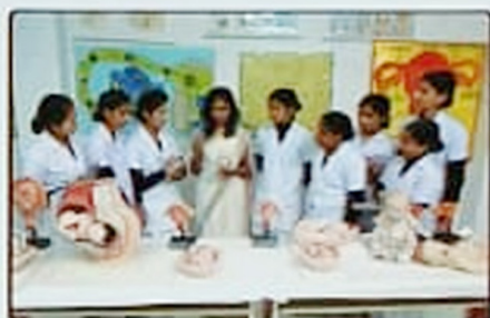
Nursing Foundation Cum Medical Surgical Laboratory

Planned equipped different laboratories with beds, manikins (for procedure demonstration), models, instruments, charts, posters, community bags are available. The laboratories provide opportunities to demonstrate, practice and evaluate the skills of students.